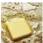
Butter / oil